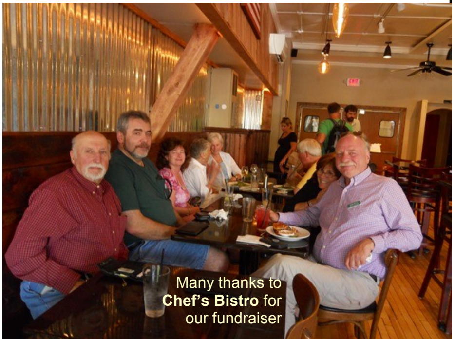
Many thanks to Chef's Bistro for our fundraiser