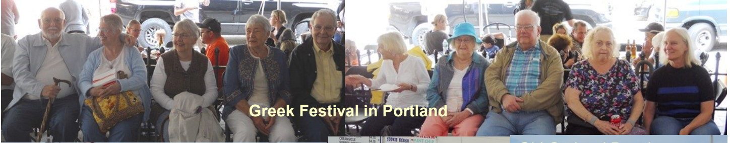
Greek Festival in Portland