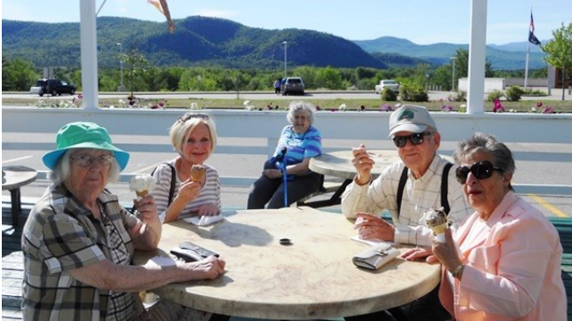
Lupines, Polly's Pancakes, & Ice Cream