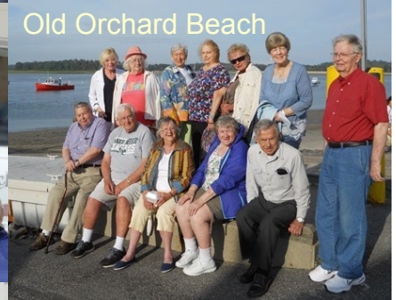
Old Orchard Beach