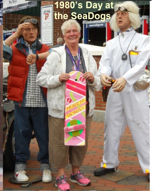
1980's Day at the SeaDogs