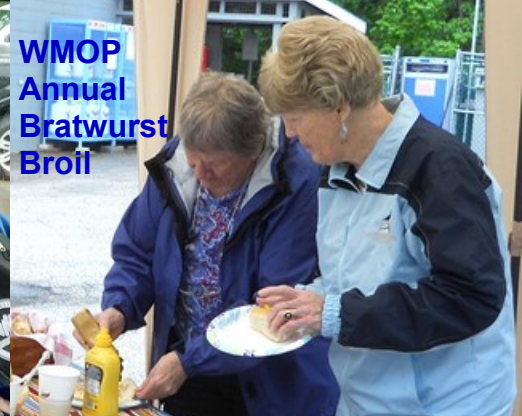
WMOP Annual Bratwurst Broil