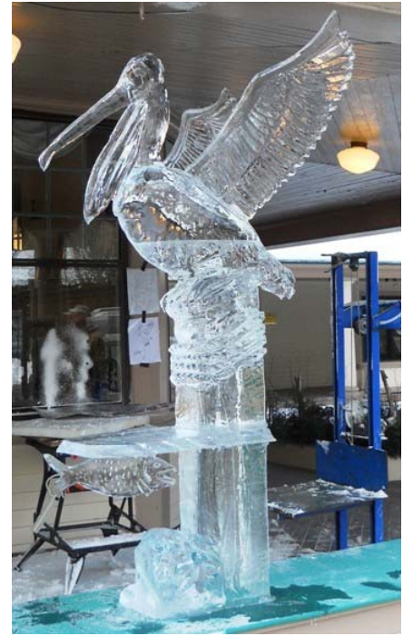
Ice Carving Luncheon At the Wentworth In Jackson