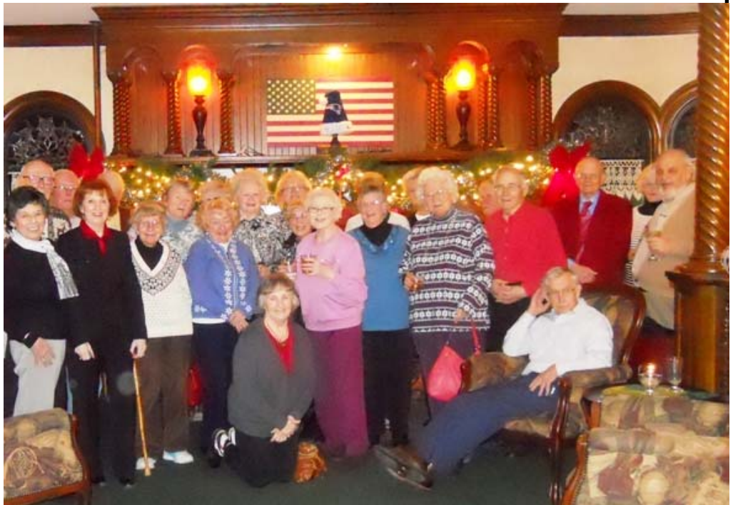
Dinner at the Stonehurst