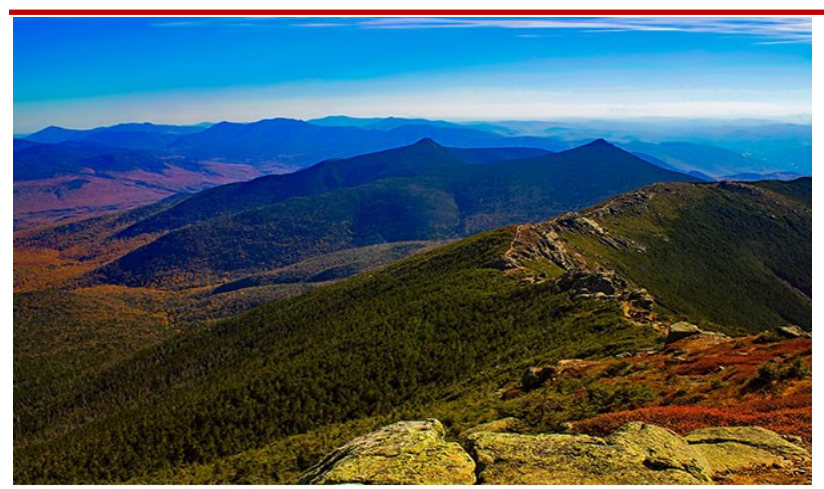
MWV Age-Friendly Community Teams With