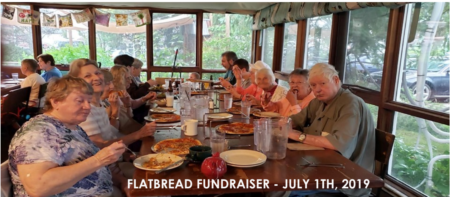
FLATBREAD FUNDRAISER - JULY 11TH, 2019

Cruise - Boston to Quebec: Sept 18-25, 2020, price based on cabin