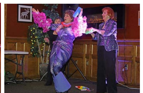
Mouth Off