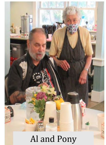
Al and Pony