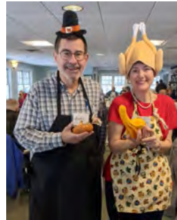
Q and AM, servers