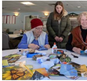
Box Making Class