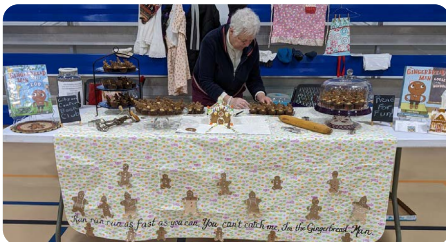
Cupcake Battle, Gibson Book Club won the best display

We are honored and thrilled to have these extraordinary chefs join us. Don't miss it.