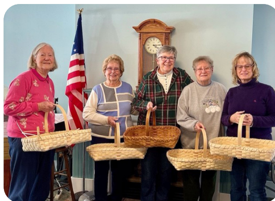
Photo from OLLI Basket Weaving Event

Caregiver Peer Support: There are caregivers who have probably experienced your challenges & can offer a non-judgmental ear. Currently caregivers prefer phone calls so they can keep their loved ones safe.