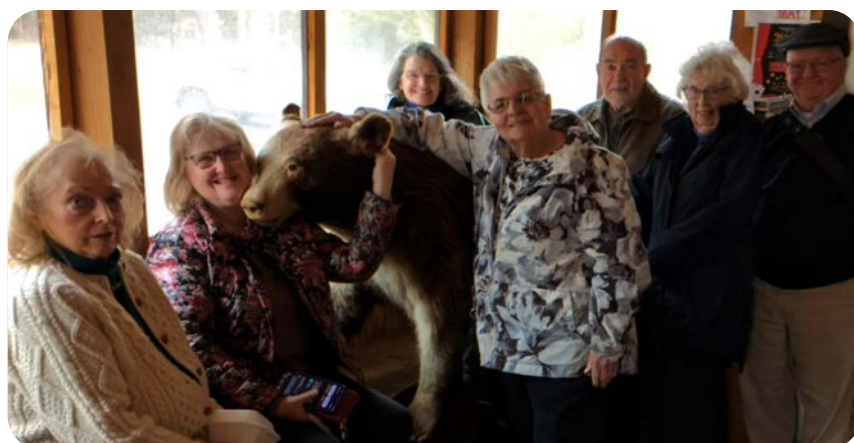
Photo from trip to Country Village