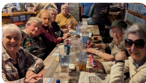
Photos from Red Parka Pub BINGO