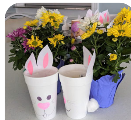
Pine Tree K Kids